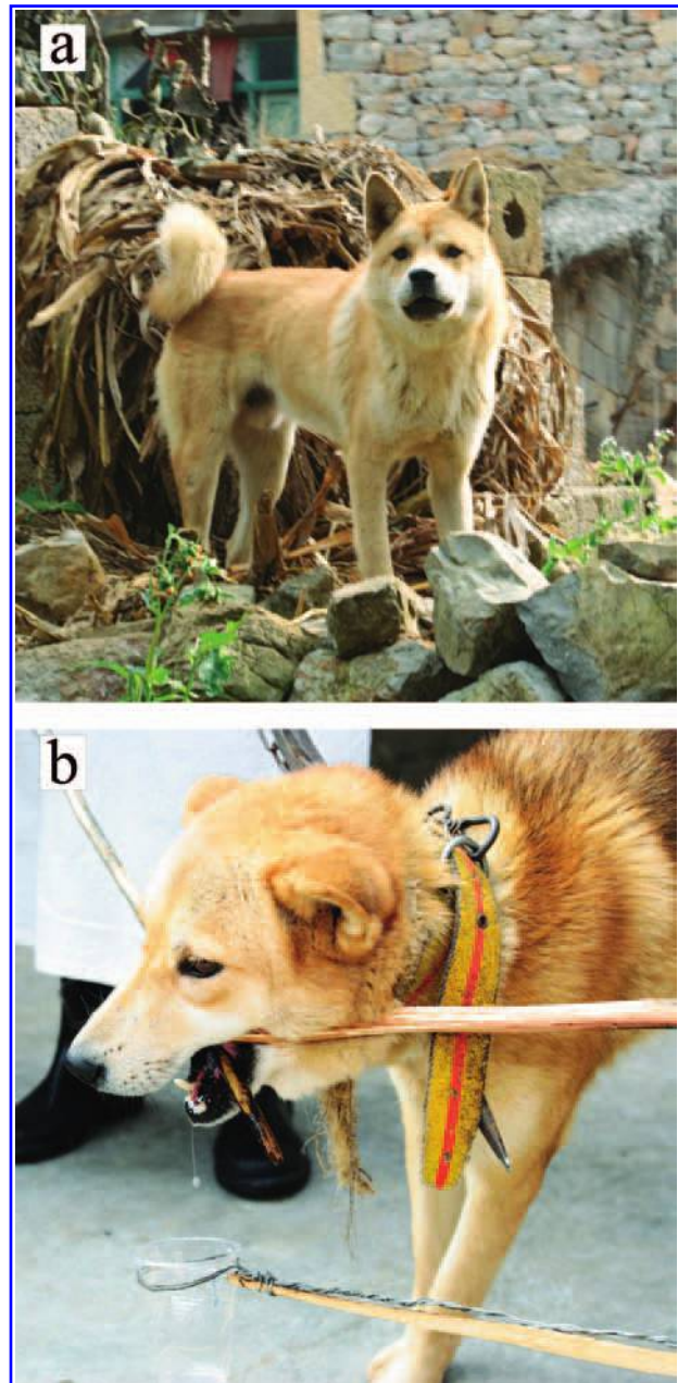
FIG. 1. Dogs were trapped in endemic rabies foci in Anlong county (a), and the saliva was collected from an ELISA-positive dog before being euthanized (b).

As summarized in Table 2, virus-neutralizing antibodies \geq 0.5 IU were detected in 2 serum samples collected at the beginning of the experiment. One sample showed antibody titers closer to the 0.5 IU. However, antibody titers declined at the second collection, indicating that no virus infection occurred during the observation period. Furthermore, no virus-neutralizing antibodies were detected in any of the cerebrospinal fluid samples (data not shown).